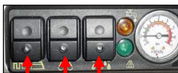
Hot Water Injection