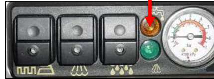
Low Water Light