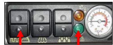
Power Steam Ready

During use, the green Steam Ready light will blink indicating the boiler is heating.